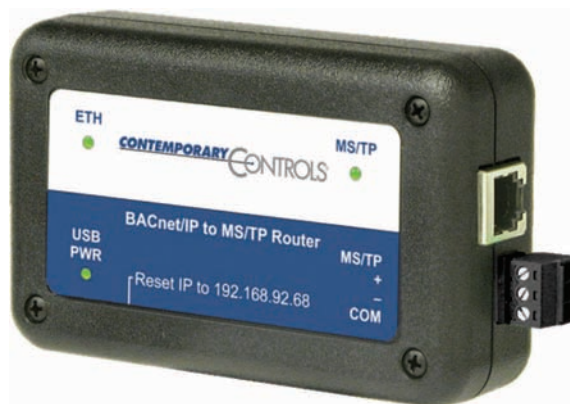
The BASRTP-B Portable BAS Router derives its power from laptop computers.

The Max Masters parameter defines the highest MS/TP master address that will participate in the token-passing. If you are not sure of the number, use the default value of 127. Max Info Frames indicates the largest number of frames that will be sent by a station before it releases the token. Adhering to a customer request, we have increased that number from 40 to 100. This would improve router performance by allowing the BAS Router to purge accumulated messages quickly once it receives the token again. The BAS Router needs both a Device Instance to be